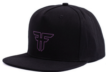
TRADEMARK FML1CP02 BLACK / PURPLE