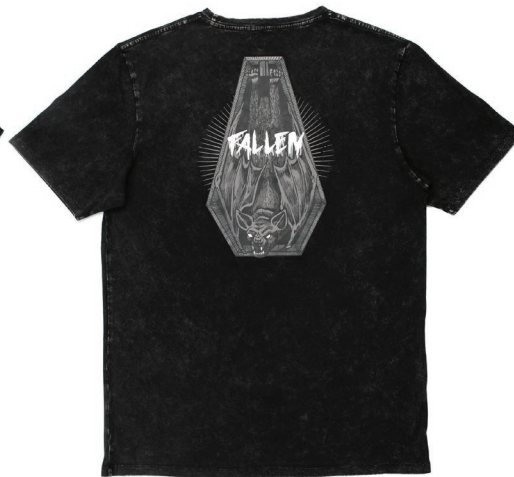
DEAD MOON TEE FML1RE19 100% COTTON - 160 GRS BLACK WASHED / WHITE