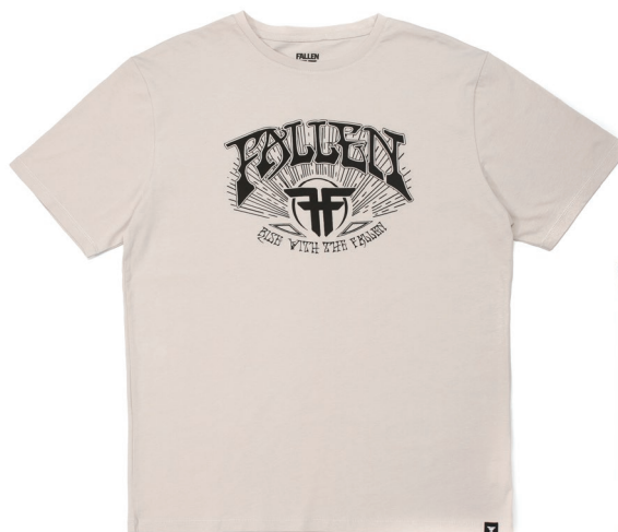
HENDRIX TEE FML1RE07 100% COTTON - 160 GRS BEIGE / BLACK