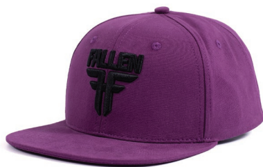
INSIGNIA FML1CP01 PURPLE