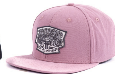
HENDRIX PATCH FMK1CP05 LAVENDAR PINK / BLACK