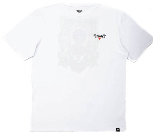
DEAD HEAD TEE FJL1RE04 100% COTTON - 160 GRS WHITE / BLACK