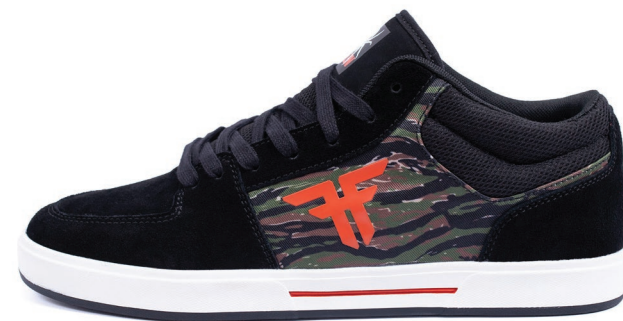
BLACK / TIGER CAMO FML1ZA17 SUEDE / POLIESTER / CUPSOLE