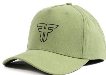
TRADEMARK CURVE FML1CP09 FERN GREEN / BLACK