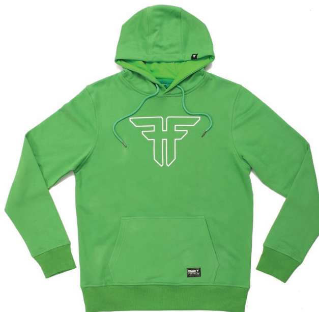
TRADEMARK HOODIE FML1BU02 60% COTTON - 40% POLYESTER - 300 GRS FERN GREEN / BEIGE