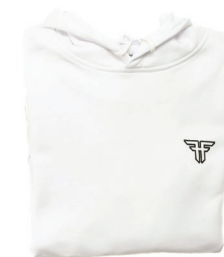
WHITE / BLACK