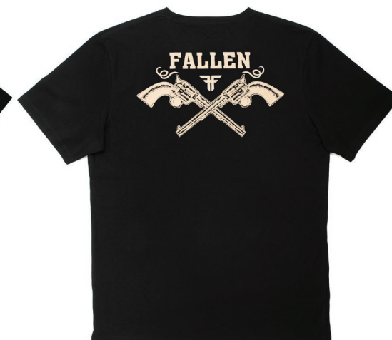
REVOLVER TEE FML1RE10 100% COTTON - 160 GRS BLACK / GOLD