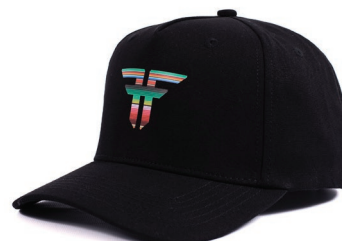
TRADEMARK CURVE FML1CP09 BLACK / PRINTED