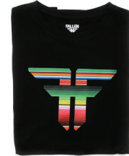
BLACK / PRINTED