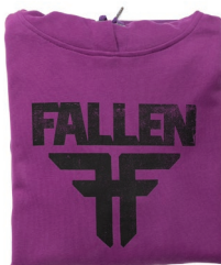
PRUNE / BLACK