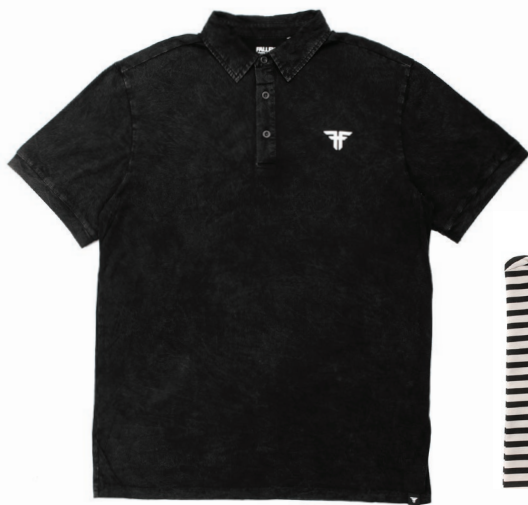
TRADEMARK POLO FML1P001 100% COTTON - 160 GRS BLACK ENZYMATIC