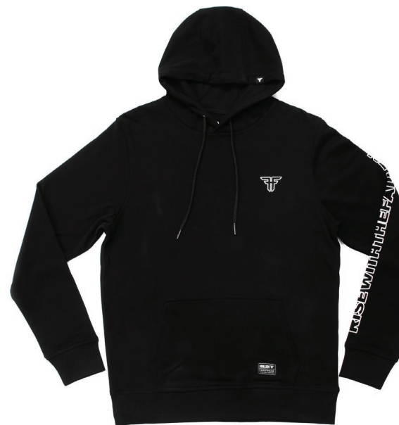
RISE WITH HOODIE FML1BU04 100% COTTON - TIE DYE - 300 GRS BLACK / WHITE