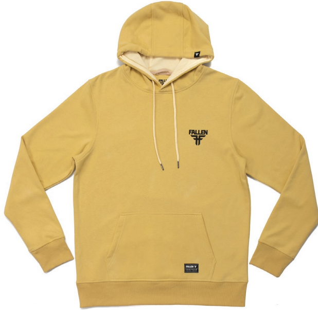
TRADEMARK II HOODIE FML1BU05 60% COTTON - 40% POLYESTER - 300 GRS SAND / BLACK