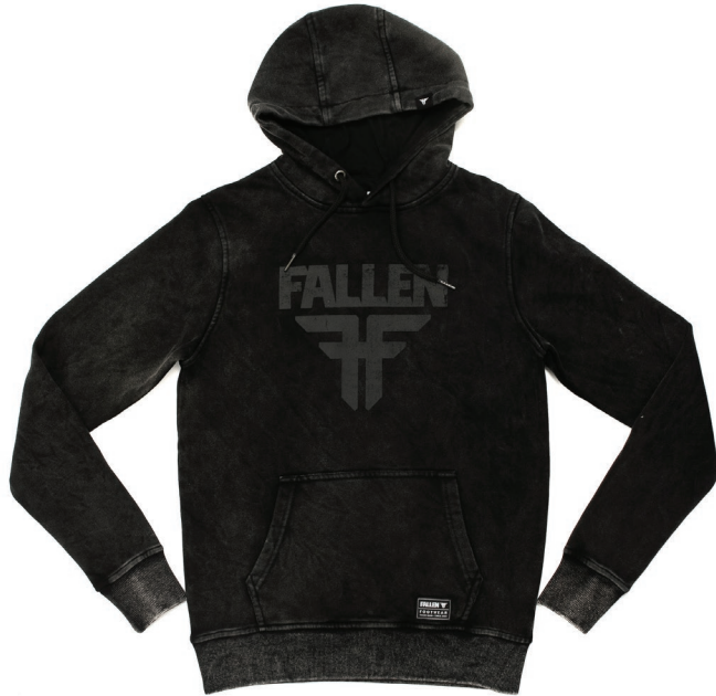
INSIGNIA HOODIE FJL1BU01 60% COTTON - 40% POLYESTER - 280 GRS BLACK ENZYMATIC