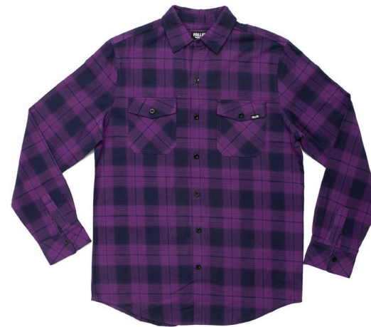
LIGHT LAMB FLANNEL FML1CM01

HEAVY BRUSHED FLANNEL 92% POLYESTER - 4% ACRYLIC LINING 100% SHERPA POLIESTER AND PADDING RED / BLACK