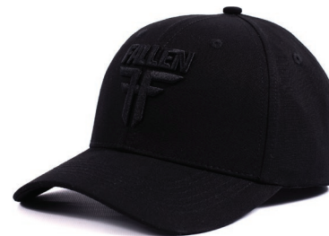
INSIGNIA CURVE FML1CP08 BLACK / BLACK