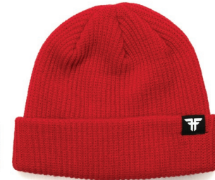
TRADEMARK BEANIE FML1G001 RED