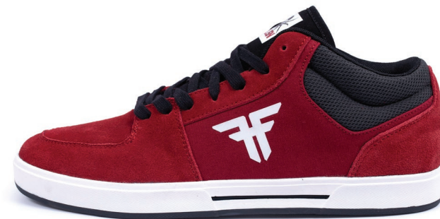
OXBLOOD / GRAY FML1ZA16 SUEDE / CANVAS / CUPSOLE