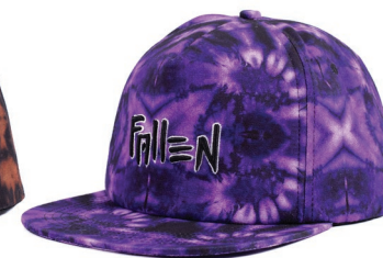
CLAW FML1CP03 PURPLE / BLACK