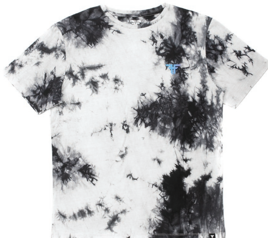
TIE-DYE TRADEMARK FML1RE15 100% COTTON - 160 GRS BLACK / TIE DYE