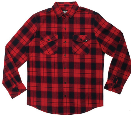
LIGHT LAMB FLANNEL FML1CM01

ANORAK 100% POLYESTER WITH PU COATING - LINING POLYESTER. RUST / BLACK