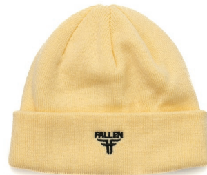
INSIGNIA BEANIE FML1G002 SAND / BLACK