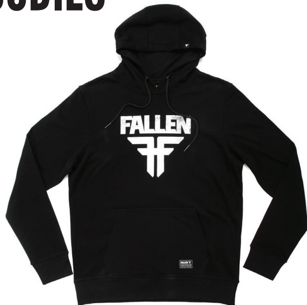
INSIGNIA HOODIE FML1BU01 100% COTTON - TIE DYE - 300 GRS BLACK / WHITE