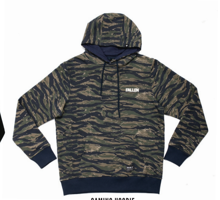
CAMINO HOODIE FJL1BU03 60% COTTON - 40% POLYESTER - 280 GRS CAMO / WHITE