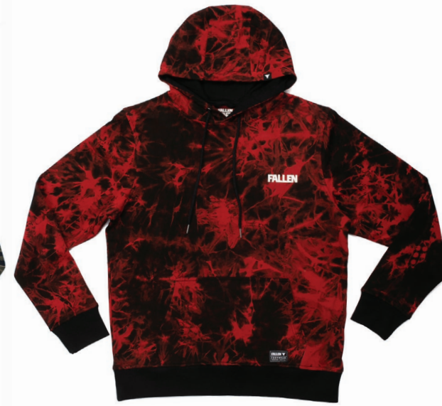
CAMINO HOODIE FML1BU07 100% COTTON - 300 GRS RED / BLACK