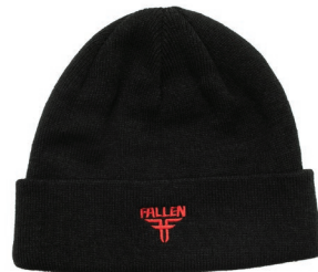
INSIGNIA BEANIE FML1G002 BLACK / RED