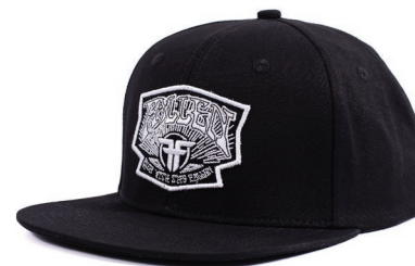
HENDRIX PATCH FMK1CP05 BLACK / BLACK