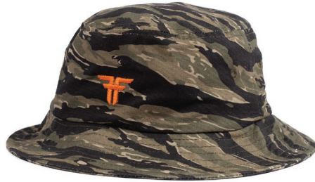
HUNTER HAT FML1CP07 CAMO PRINTED