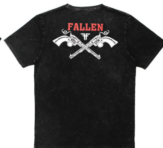
REVOLVER TEE FML1RE10 100% COTTON - 160 GRS BLACK WASHED / WHITE