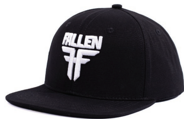
INSIGNIA FML1CP01 BLACK