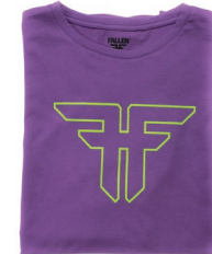
PURPLE / LIME