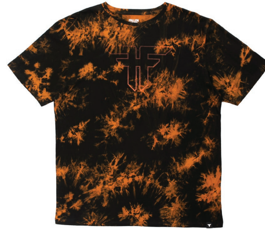
TRADEMARK TEE FML1RE02 100% COTTON - 160 GRS BLACK / ORANGE