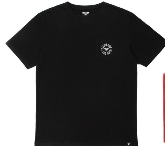
RISE WITH POCKET FML1RE17 100% COTTON - 160 GRS BLACK / WHITE