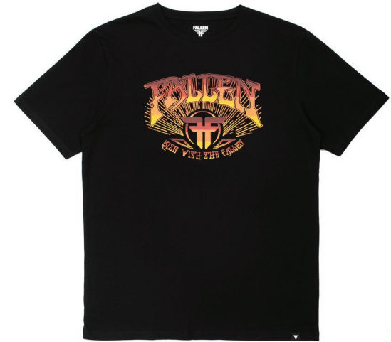
HENDRIX TEE FJL1RE03 100% COTTON - 160 GRS BLACK / ORANGE GRADIENT