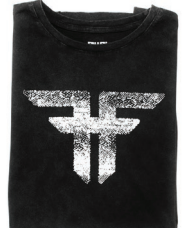
BLACK ENZYMATIC / WHITE