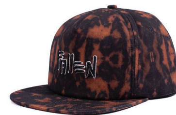
CLAW FML1CP03 BLACK / ORANGE