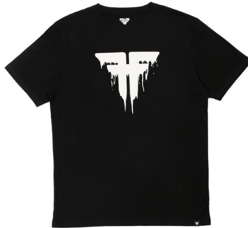
D RIP TEE FJL1RE02 100% COTTON - 160 GRS BLACK / WHITE