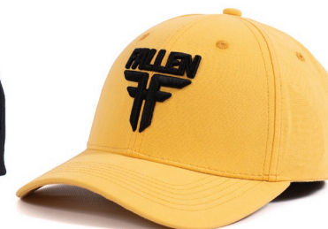
INSIGNIA CURVE FML1CP08 SAND / BLACK