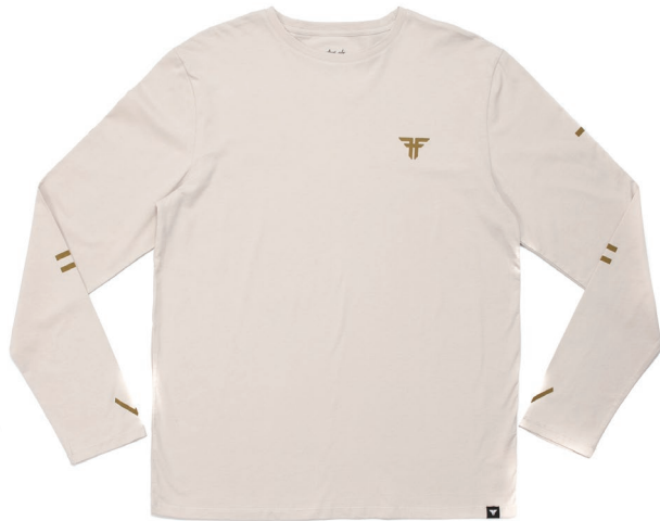
STRIKER L/S TEE FML1RE11 100% COTTON - 160 GRS BEIGE / BROWN