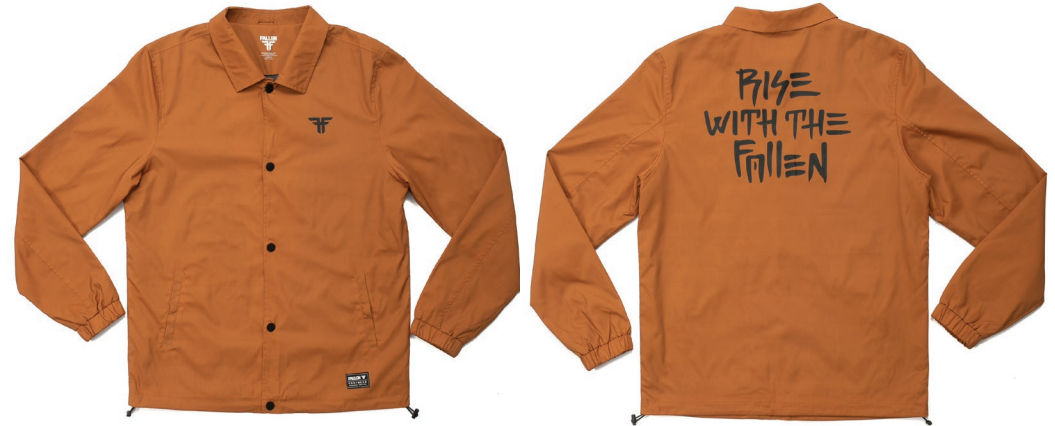
RISE WITH WINDBREAKER FMK1CA01

ANORAK 100% POLYESTER WITH PU COATING - LINING POLYESTER. BLACK / WHITE