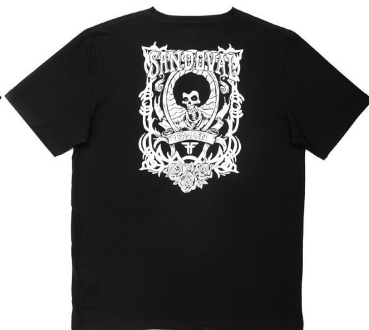
DEAD HEAD TEE FML1RE18 100% COTTON - 160 GRS BLACK / WHITE