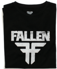
BLACK / WHITE