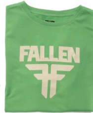
FERN GREEN / BEIGE