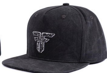
TRADEMARK FML1CP02 BLACK / ENZYMATIC WASH