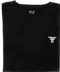
BLACK / GRAY