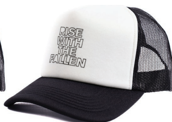
RISE WITH THE FALLEN FMK1CP04 WHITE / BLACK