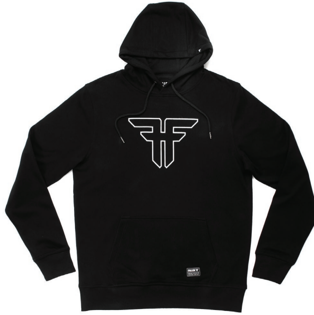
TRADEMARK HOODIE FJL1BU02 60% COTTON - 40% POLYESTER - 280 GRS BLACK / WHITE