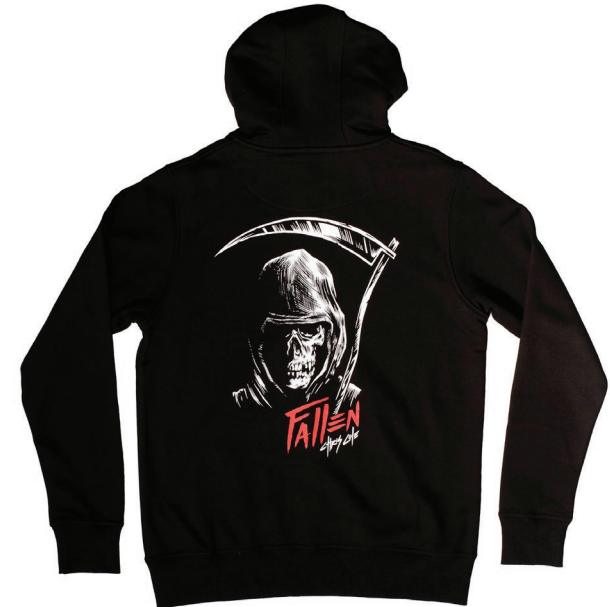
TROOPER HOODIE FMJ1BU03 60% COTTON - 40% POLYESTER - 260 GRS BLACK