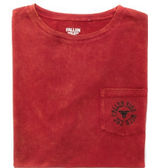
OXBLOOD / BLACK