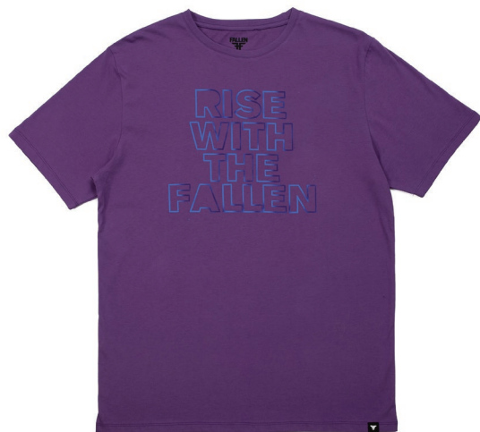
RISE WITH TEE FML1RE06 100% COTTON - 160 GRS PLUM / AQUA