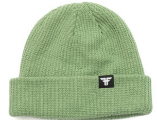
TRADEMARK BEANIE FML1G001 FERN GREEN