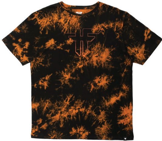
TRADEMARK TEE FJL1RE01 100% COTTON - 160 GRS BLACK / ORANGE