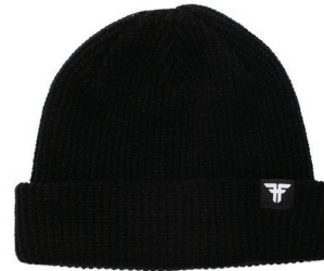
TRADEMARK BEANIE FML1G001 BLACK