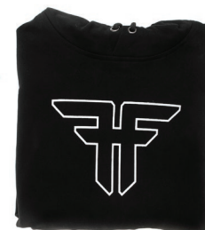
BLACK / WHITE