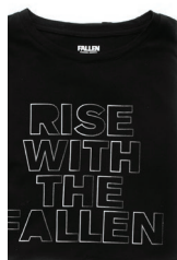
BLACK / WHITE