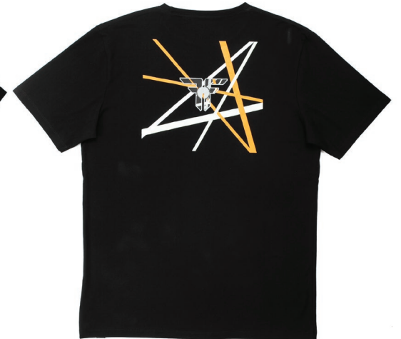
FRACTURE TEE FML1RE12 60% COTTON - 40% POLYESTER - 300 GRS BLACK