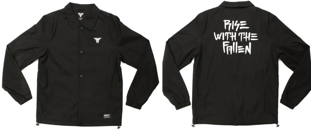
RISE WITH WINDBREAKER FMK1CA01

ANORAK 100% POLYESTER WITH PU COATING - LINING POLYESTER. BLACK / WHITE