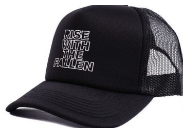
RISE WITH THE FALLEN FMK1CP04 BLACK / WHITE