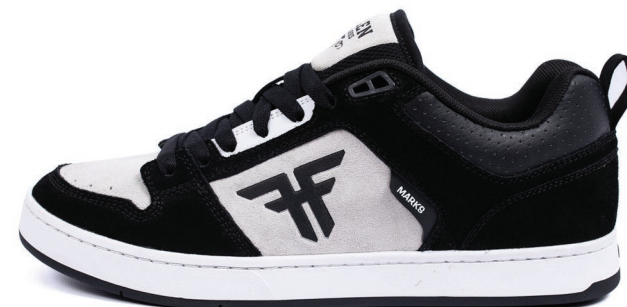
BLACK / WHITE FF FML1ZA07 SUEDE / CUPSOLE / TRUE FIT