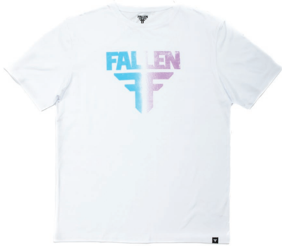
INSIGNIA TEE FML1RE01 100% COTTON - 160 GRS WHITE / VIOLET