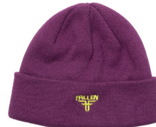
INSIGNIA BEANIE FML1G002 PLUM / LIME