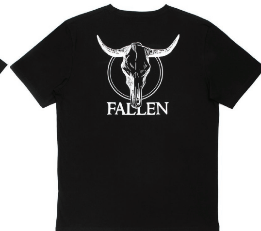
DESERT TEE FML1RE09 100% COTTON - 160 GRS BLACK / WHITE