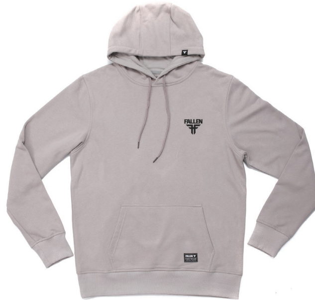
TRADEMARK II HOODIE FMK1BU07 60% COTTON - 40% POLYESTER - 300 GRS GRAY / BLACK