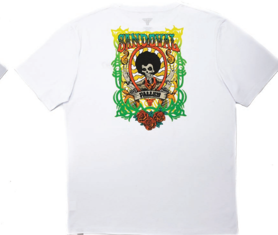
DEAD HEAD TEE FML1RE18 100% COTTON - 160 GRS WHITE / BLACK