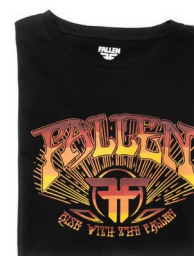
BLACK / ORANGE GRADIENT