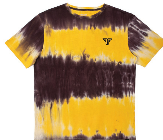
TIE-DYE TRADEMARK FML1RE15 100% COTTON - 160 GRS PURPLE / TIE DYE