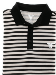
BLACK / GRAY