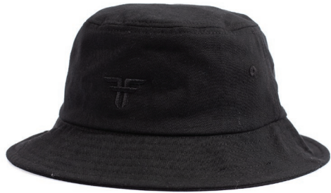
HUNTER HAT FML1CP07 BLACK W / ENZYMATIC WASH