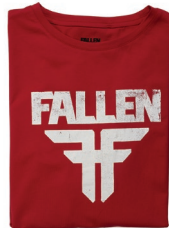
OXBLOOD / WHITE