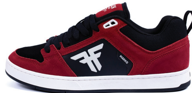
BLACK/RED FF FML1ZA06 SUEDE / PU NUBUCK / CUPSOLE / TRUE FIT