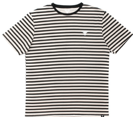
STRIPES FML1RE13 100% COTTON - 160 GRS BLACK / GRAY