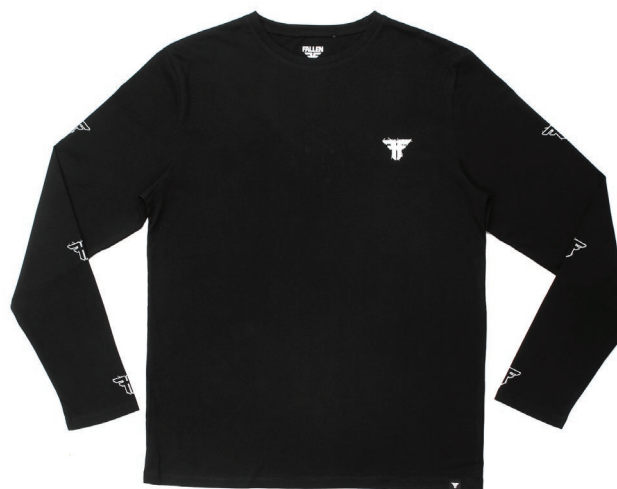
METAL LONGSLEEVE FML1RE04 100% COTTON - 160 GRS BLACK / WHITE